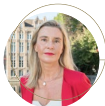
Federica Mogherini – Rector